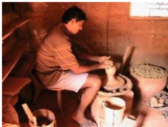
Art and Craft

Goa has overall best wild reserves and bird sanctuaries as it lies at foothill of the Western Ghats. It also has dazzling variety of flora and fauna which tourist love to discover so when you are in Goa it is a must that you attend the call of the wild.